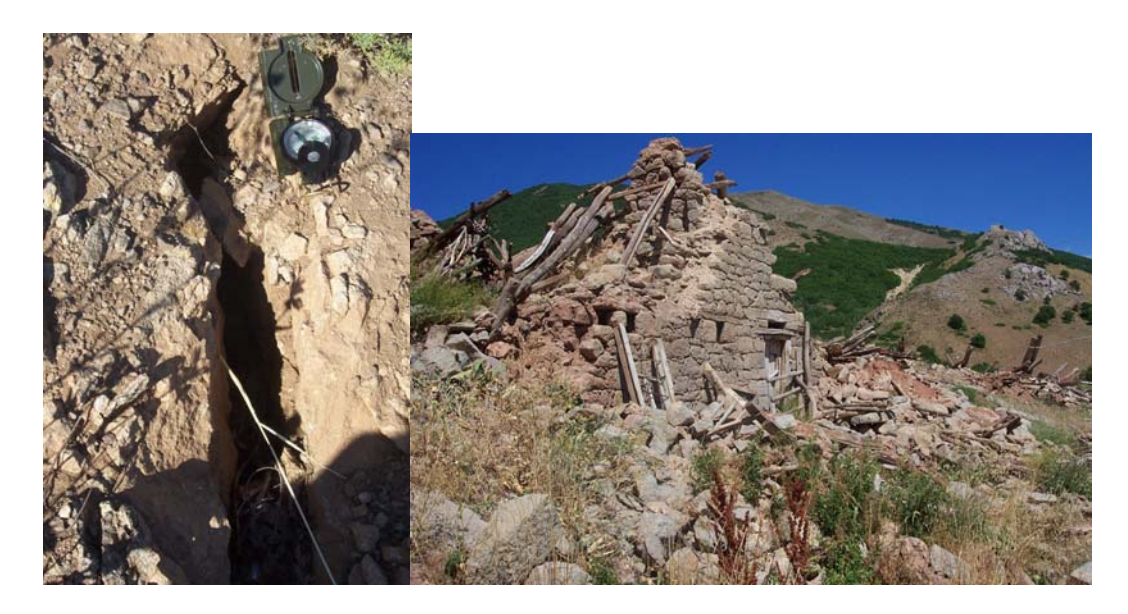
Figure 2. Fault trace and a sample of traditional village house damaged by earthquake

The preliminary field observation undertaken by Seismology Team. The hypocentral location of the 2003 Pülümür earthquake is about 4.5 km W-SW distance of the Sağlamtaş village. This region located between Hor brook and Sal brook (Kalafat et al., 2003).